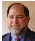
Ronald Rivest RSA Cryptography