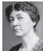
Mary Engle Pennington Food Preservation and Storage (Posthumous)