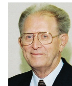
Joseph C. Shivers, Jr. LYCRA® Fiber/Spandex (Posthumous)