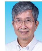
Ching Wan Tang Organic Light-Emitting Diode (OLED)