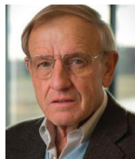
Marvin Caruthers Chemical Synthesis of DNA