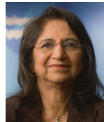
Sumita Mitra Nanocomposite Dental Materials