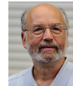
Adi Shamir RSA Cryptography