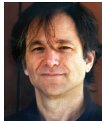
Leonard Adleman RSA Cryptography