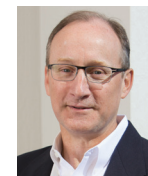
Steven Van Slyke Organic Light-Emitting Diode (OLED)